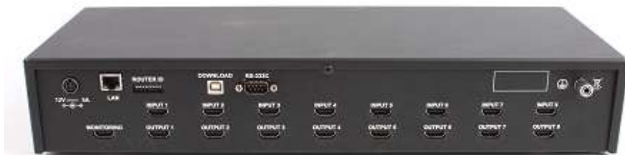
<Rear Panel of OHM-88>