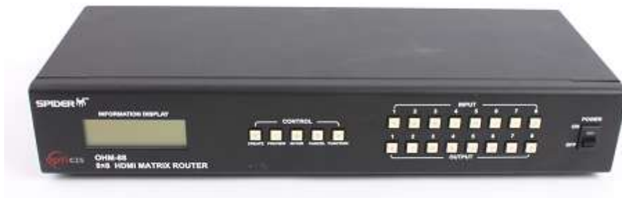
<Front Panel of OHM-88>