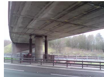
Motorway Bridge Deck and Soffit