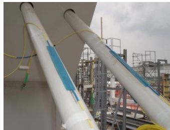
Airport Roof Structure