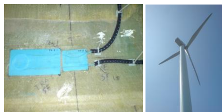
Wind Turbine Rotorblade Roots