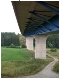
Road Bridge Superstructure